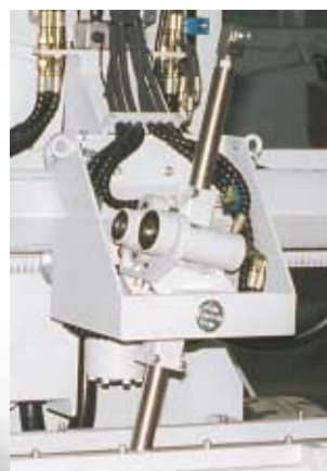
Tool holding fixture.

Headquarters: 121 Corporate Lane New Bern, NC 28562 O: 252-631-7188 * 1-800-217-8677 www.chemacinc.com E-Mail: chemac@chemacinc.com service@chemacinc.com