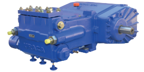
KD716 Stuffing box area

Please note: Pump blocks and pump block casings in the former versions are no longer available.